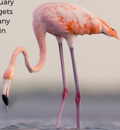
American Flamingo

Since 1998, every February this worldwide event gets birders to count as many birds as they can find in their favorite areas, to help expand our understanding of birds.