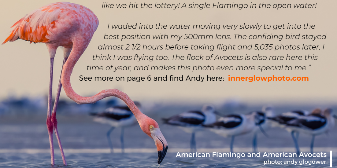
American Flamingo and American Avocets