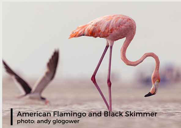
American Flamingo and Black Skimmer

Their normal range extends from the southernmost parts of the Gulf Coast of the US through the Caribbean islands, Central America, down to northern South America. Once native to Florida, flamingos disappeared from the state around the turn of the 20th century. A captive breeding colony formed at Hialeah Park Race Track in the '30s, which remains. Now, outside of Hialeah, more than 95% of observations occur within the Everglades, Biscayne Bay and the Florida Keys.