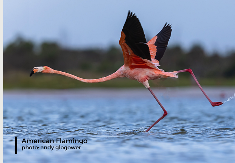
American Flamingo

Often seen in large flocks, their behavior is fascinating. Intensely social, they engage in synchronized movements and intricate courtship rituals, which include vocalizations and dancing. This interaction helps maintain the cohesion of their colonies and contributes to their survival.